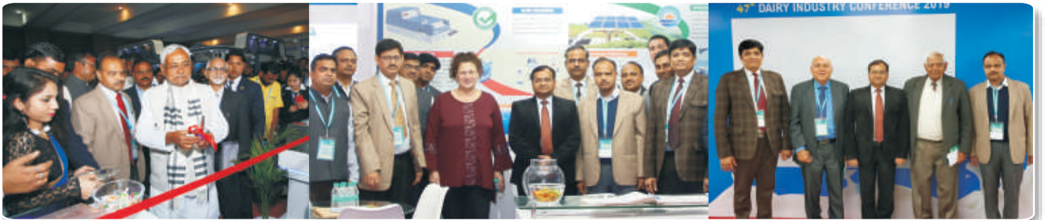
Hon'ble CM, Bihar inaugurating REIL Stall